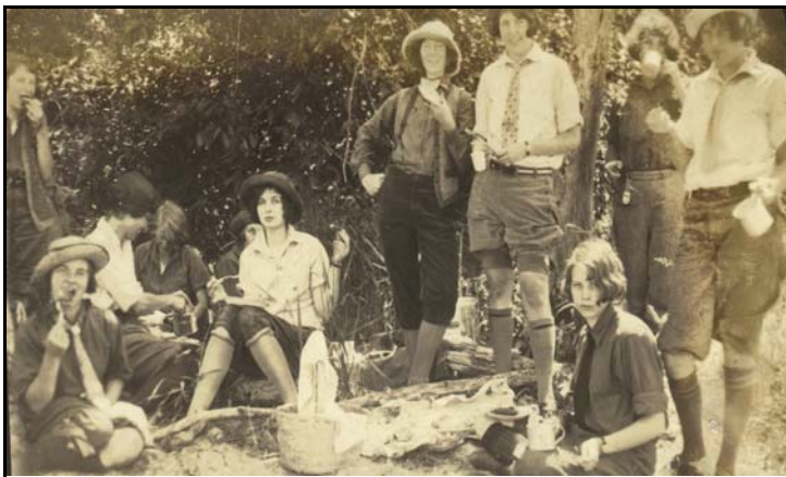
Campcraft at Kawajiwini - 1924

Without wanting to appear "greedy" we would welcome any additional photos and memorabilia - including brochures, newsletters, etc. of Kamaji to add to our collection. Should you not want to permanently let go of your pictures, etc. perhaps you would loan them long enough to allow us to make copies of the photos. We promise to safeguard them until their return to you. As always, thank you!