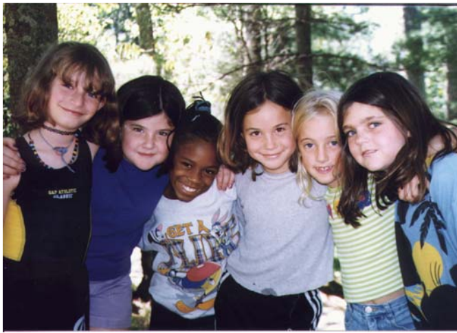
Hatchery Group 1999