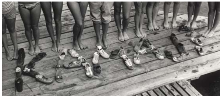
Swim Docks - 197?