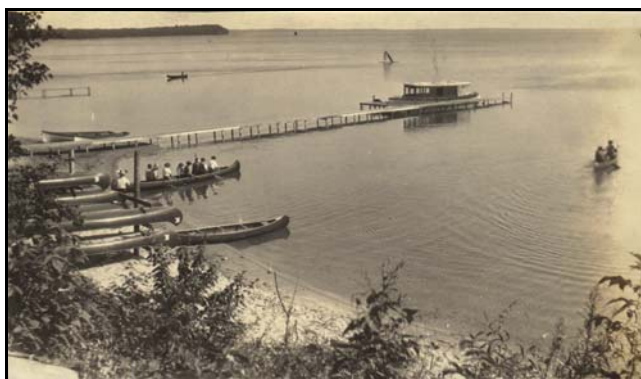
View of Kawajiwini's Waterfront - Star Island, Cass Lake, MN - 1920's

Those are our immediate plans for the summer of 2000. Of course, as the season quickly approaches, we often find that our list of "Things to Do" grows increasingly longer. First and foremost, we will continue to work hard to insure that Kamaji will continue in the same tradition as it has for the past 86 summers!!